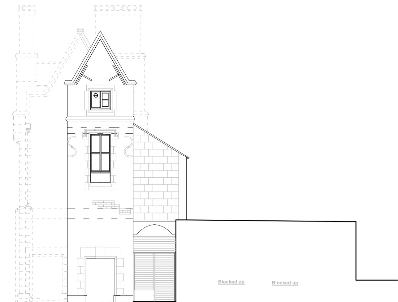
South Elevation Scale 1:100