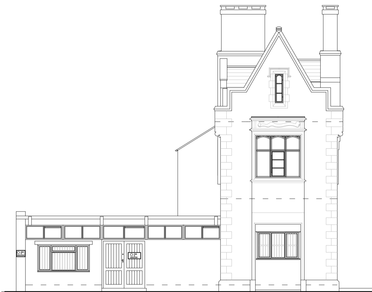
North Elevation Scale 1:100